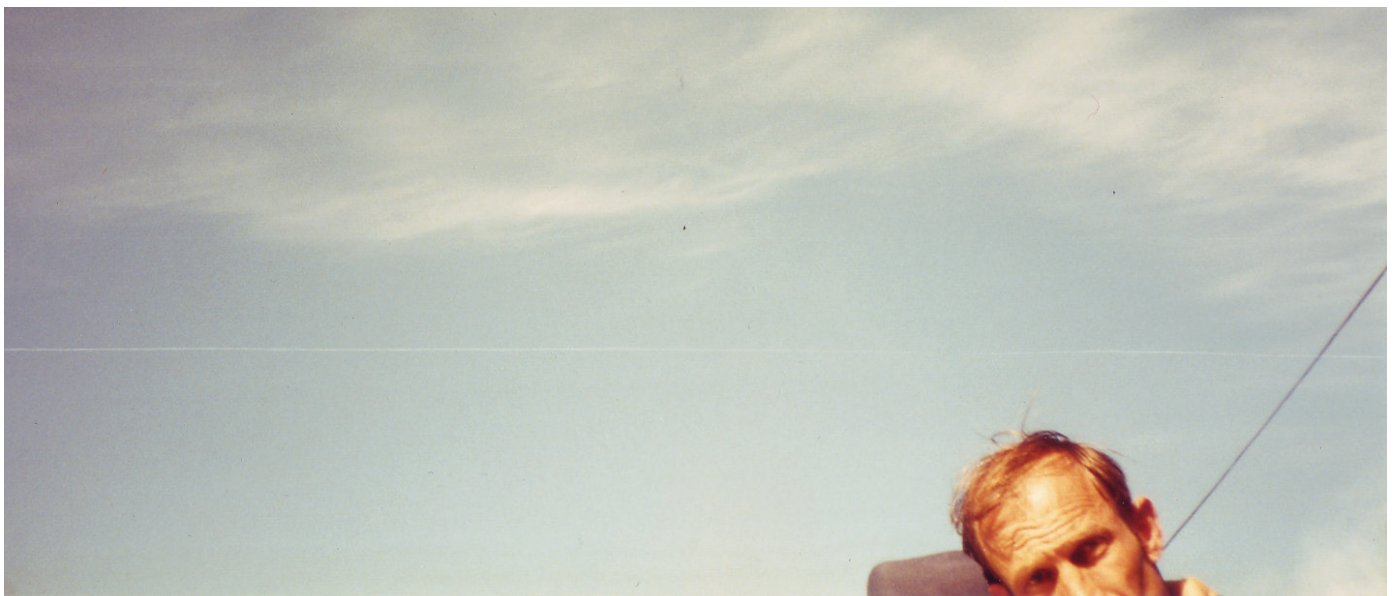
Jason Lazarus, Too Hard to Keep , 2010—present.

But rather than interpret our distance from these subjects as one of photography's insufficiencies, Lazarus's project seems to point to the interpretive possibilities that this space opens up. By looking without knowing exactly what it is we are seeing, the T.H.T.K. archive displaces the viewer's usual processes of identifying (or disidentifying) with the subject of the photograph and allows another form of working-through to unfold. In our encounter with T.H.T.K. , where prolonged looking is encouraged and judgment can (at least temporarily) be suspended, it becomes possible to think about what we want from our encounters with difficult images, and what we are compelled to do when it is too hard to look at them anymore.