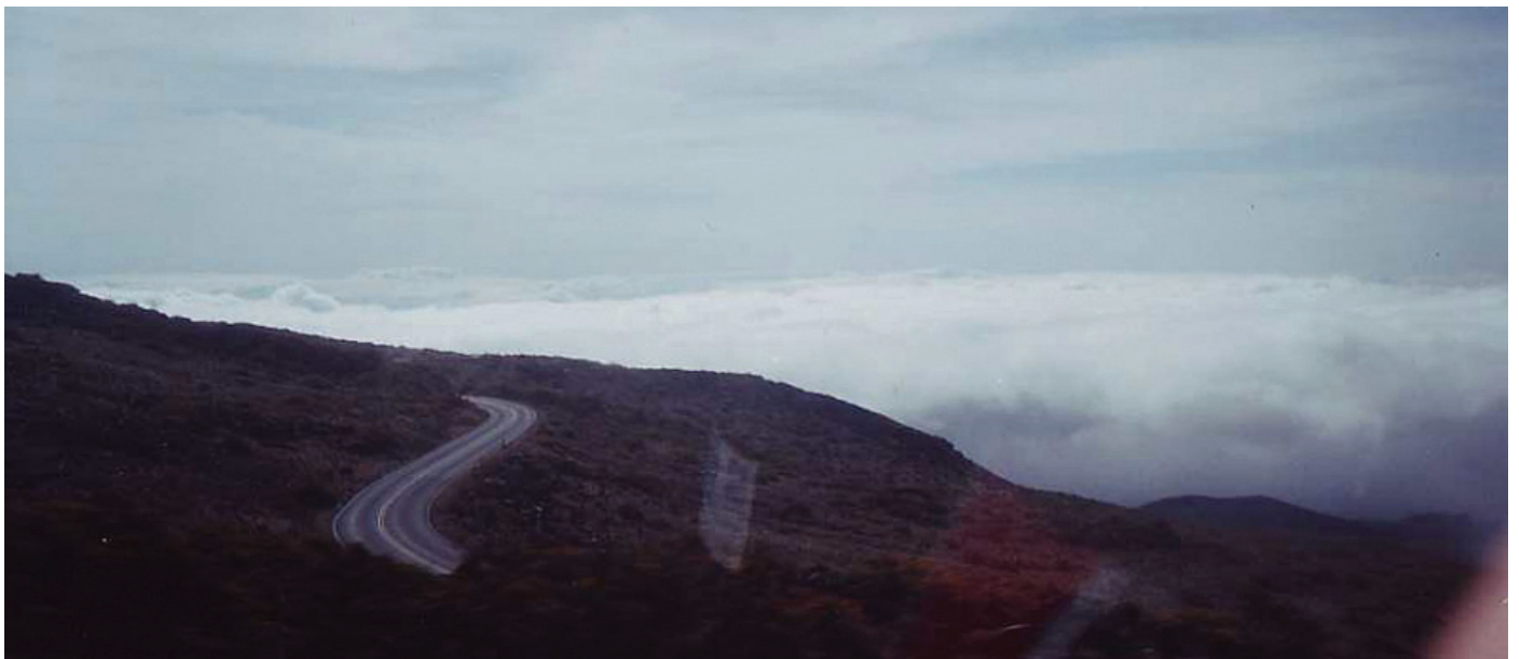
Jason Lazarus, Too Hard to Keep , 2010–present.

Seen in isolation, this particular photograph—untitled, undated and authorless—communicates none of the information we first want to ask of a photograph. No amount of looking will help us deduce who took it, where, when and for whom. But its visual reticence, and its placement in the Too Hard to Keep (T.H.T.K.) archive, prompts another set of questions: questions about what we, as viewers, want from photographs, and what we do when images challenge these expectations by refusing to provide easy interpretations. Started in 2010, Lazarus's T.H.T.K. is a repository for photographs, photo albums, photo-objects, and digital files that are too difficult for their owners to hold onto, but which are too meaningful to destroy. Stored in the artist's home, the growing archive comprises more than 3,000 photographs, which are exhibited in site-specific installations in the gallery. Bringing together a wide range